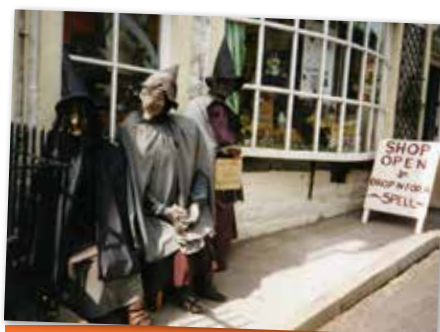
The famous Witches Galore shop in Newchurch in Pendle